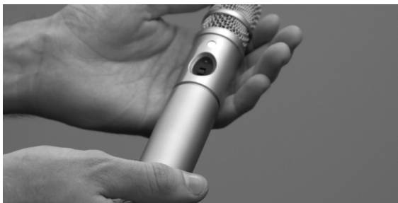
Unscrewing NT3 body