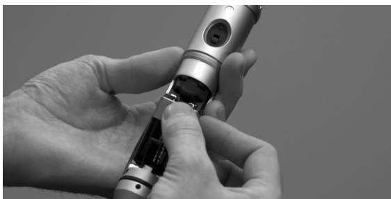
Inserting the battery