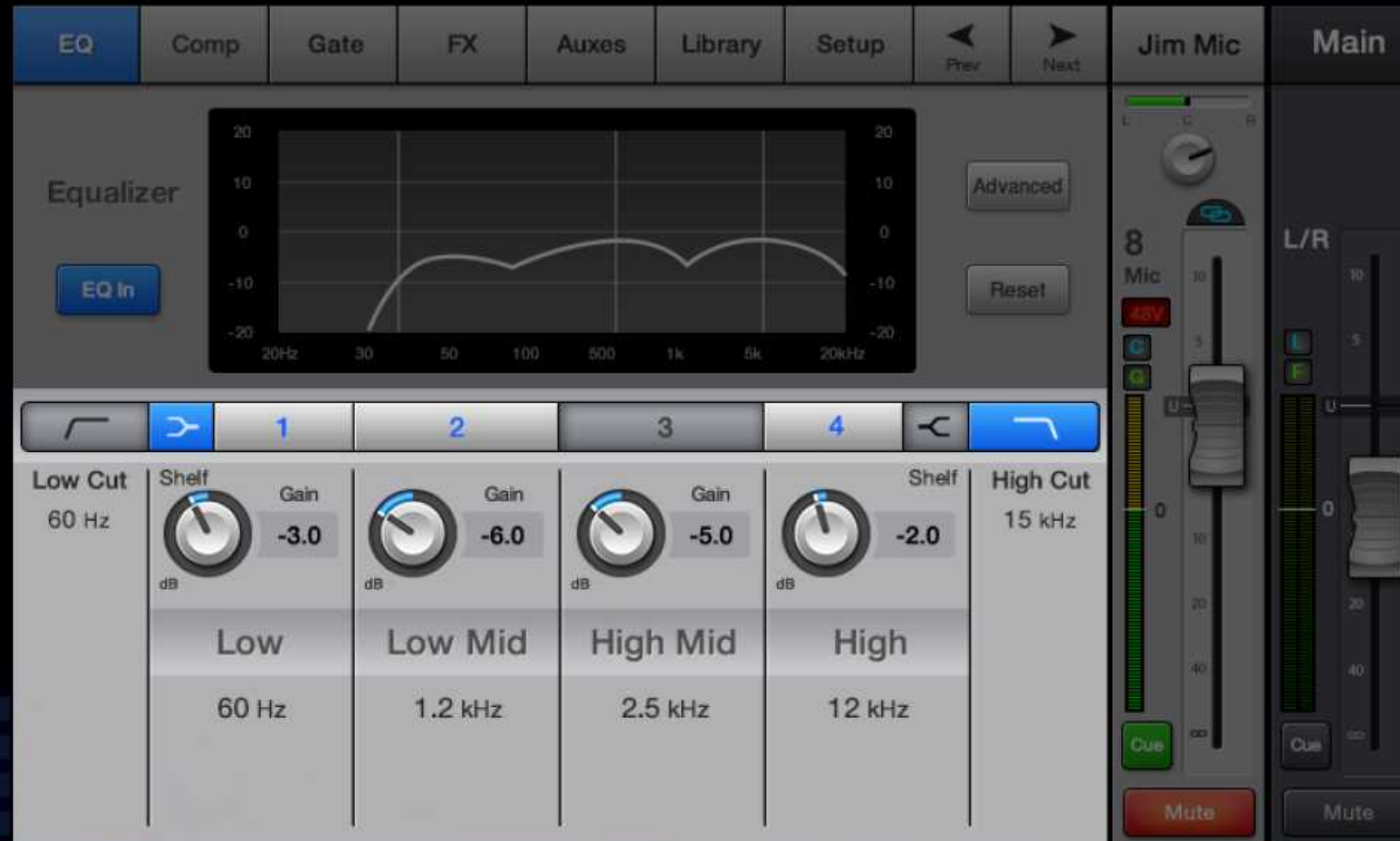
EQ SCREEN: SIMPLE MODE

SIMPLE MODE makes getting great results easy and fast (similar to the “Program” function on a DSLR camera)