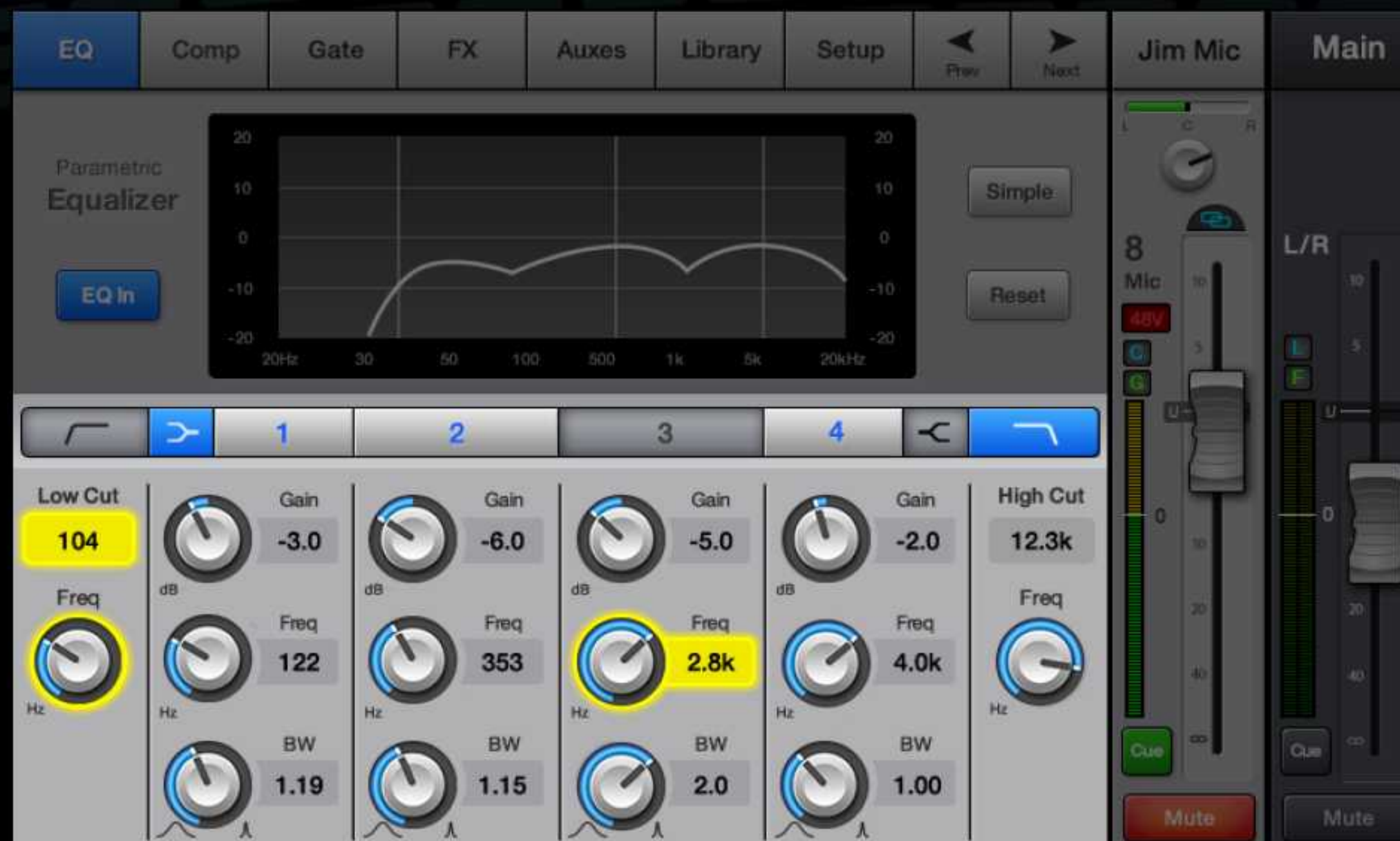
EQ SCREEN: ADVANCED MODE

ADVANCED MODE gives pro users total control over all mixer parameters