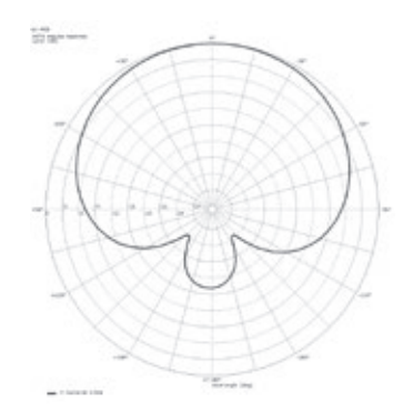
Polar pattern @ 1 kHz