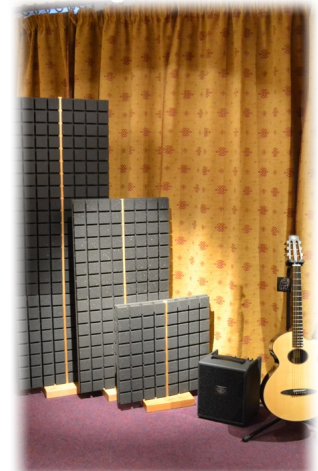
Demo room - UK