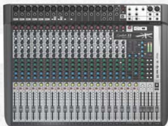
Signature 22 MULTI-TRACK

Soundcraft, Harman International Industries Ltd., Cranborne House, Cranborne Road, Potters Bar, Hertfordshire EN6 3JN, UK T: +44 (0)1707 665000 F: +44 (0)1707 660742 E: soundcraft@harman.com Soundcraft USA, 8500 Balboa Boulevard, Northridge, CA 91329, USA T: +1-818-893-8411 F: +1-818-920-3208 E: soundcraft-usa@harman.com