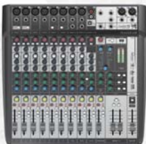
Signature 12 MULTI-TRACK

Also available: Signature Series Multi-track versions with multi-channel ultra-low latency USB audio interface -